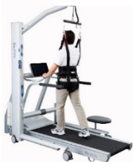
Partial Weight Bearing Treadmill