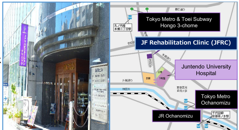
Entrance of JFRC